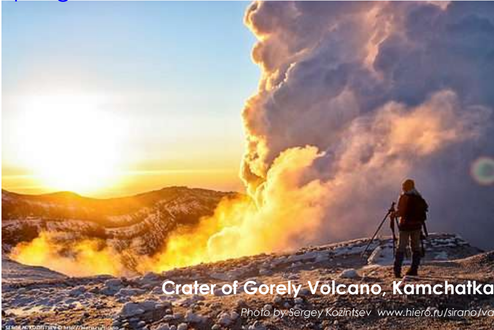
Crater of Gorely Volcano, Kamchatka