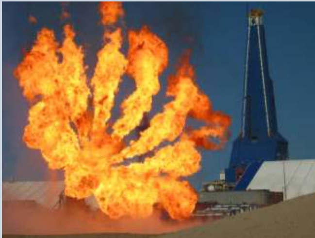
Yastreb drill rig and gas flare. Chaivo, Sakhalin Island.